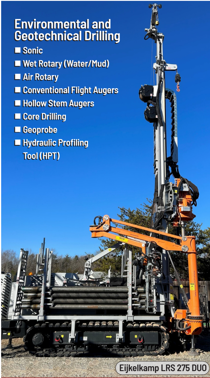
Eijkelkamp LRS 275 DUO