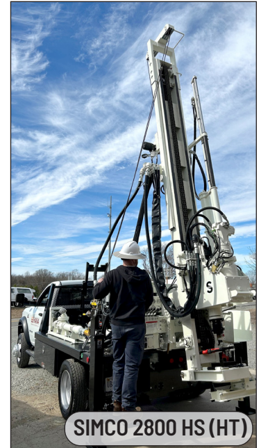
SIMCO 2800 HS (HT)

We also conduct an array of geotechnical site investigations to support vertical constructions, waterfront projects, and horizontal/Civil Works projects.